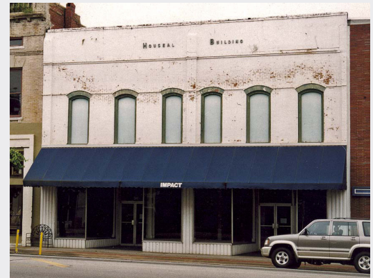
The photograph above shows the building described in the sample application prior to the rehabilitation work. Below left, the building is shown after its successful rehabilitation.