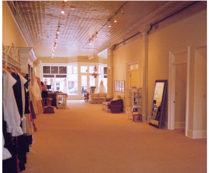
Retaining historic character: The historic tin ceiling was retained during the rehabilitation for this Main Street clothing store.

For example, Mr. Dillon has owned a downtown building for a number of years. He originally purchased the property for $150,000, and of that purchase price $40,000 was attributed to the cost of the land. Over the years, Mr. Dillon has depreciated the building for tax purposes by a total of $60,000. He recently replaced the roof at a cost of $8,000. Mr. Dillon’s adjusted basis would be $58,000. Since he intends to spend $60,000 to fix a leaking basement wall; upgrade the heating/air conditioning systems; and repair the deteriorated storefront, the rehabilitation would qualify as a substantial project. If he completes the application process and receives approval, Mr. Dillon will be eligible for a 20% credit on the cost of his rehabilitation, or a $12,000 credit.