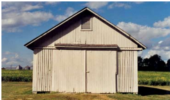
The sliding door is an important feature of this simple farm building.

If your property is located in a National Register district, it still must be designated by the National Park Service as a property that contributes to the historic character of the district, thus qualifying it as a “certified historic structure.” Not every barn in a district is contributing. For example, when historic districts are designated, they are usually associated with a particular time period, such as “1880 to 1935.” In this case, a 1950 barn would not contribute and would not be eligible for a 20% rehabilitation tax credit. On the other hand, a barn dating to 1932 could be eligible for the tax credit.