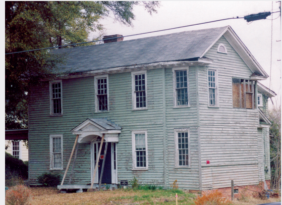
This sample application was developed for the house pictured above.

Complete these boxes until all aspects of your project are fully described. Be sure to include details like proposed finishes (drywall, plaster, etc.) and planned methods of repair. Even items that do not qualify for the credit like new additions and landscaping should be included.